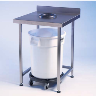
◀ Waste Clearing Station